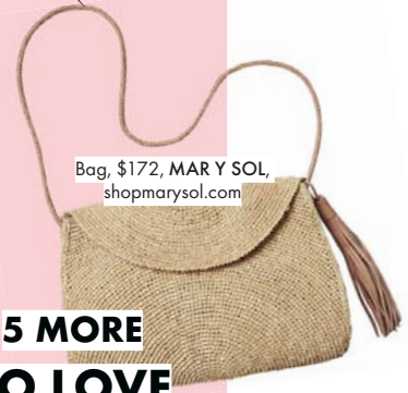
Bag, $172, MAR Y SOL, shopmarysol.com