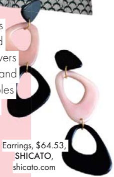
Earrings, $64.53, SHICATO, shicato.com

Shirley Gutierrez's accessories brand employs and empowers female Ecuadorians and crafts cool collectables from eco-friendly materials.