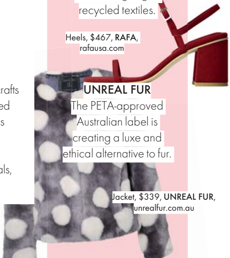
Jacket, $339, UNREAL FUR, unrealfur.com.au

The PETA-approved Australian label is creating a luxe and ethical alternative to fur.